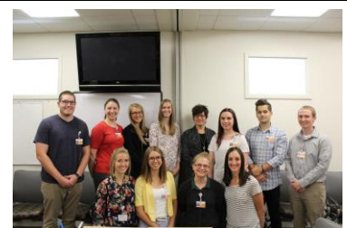
The 2018-19 Medical Laboratory Science Class at Providence Sacred Heart Medical Center.